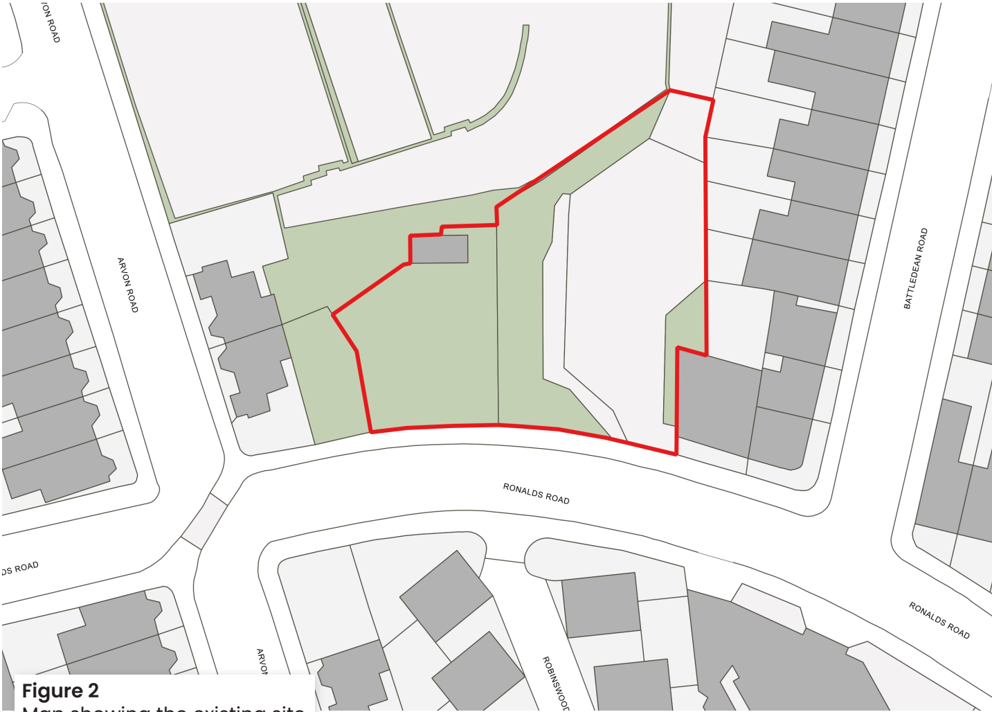
Figure 2 Map showing the existing site

The site is owned by the council, and it includes vacant land above the railway line and a car parking area.