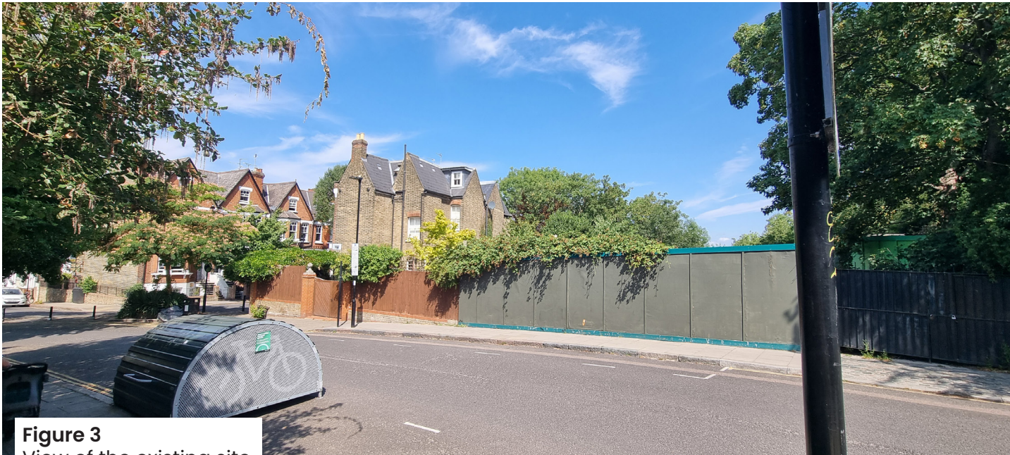
Figure 3 View of the existing site